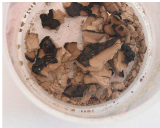
A sample of isolated hemicellulose